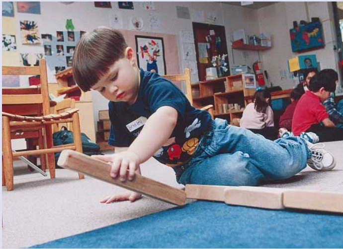
Measuring the perimeter of a rug